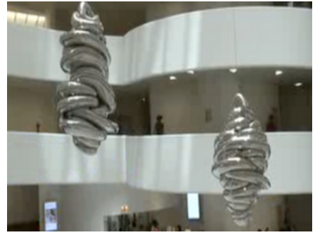
BOX" This video presents footage of the Louise