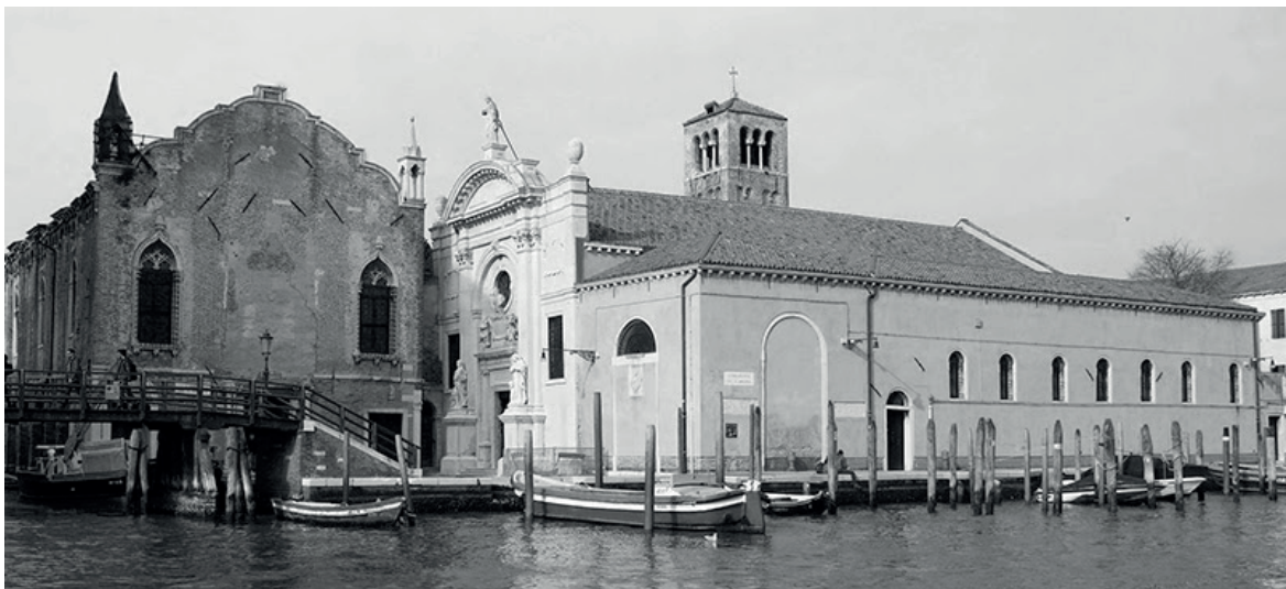
Venue: Archivi della Misericordia

*20, 21 & 22 April 2022: programs for accredited press and/or guests with invitation