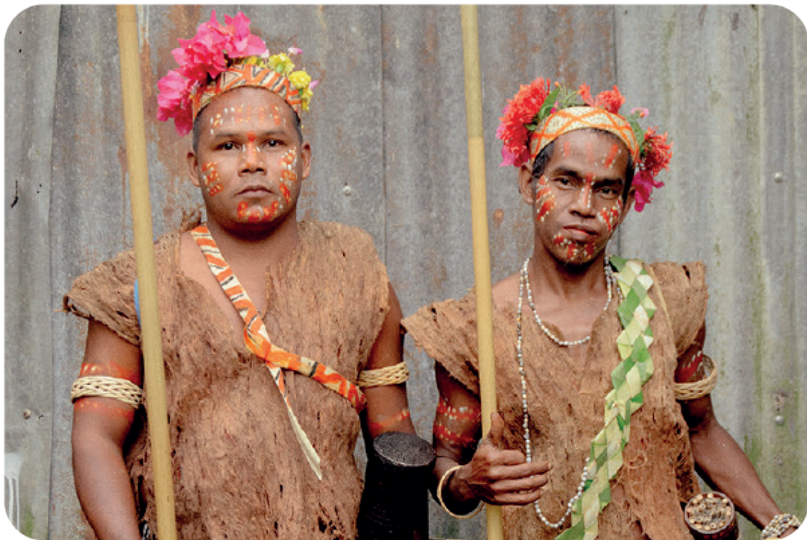
Projek Rabak. Hik Bersamak - Indigenous Pop . Video Still 2022.