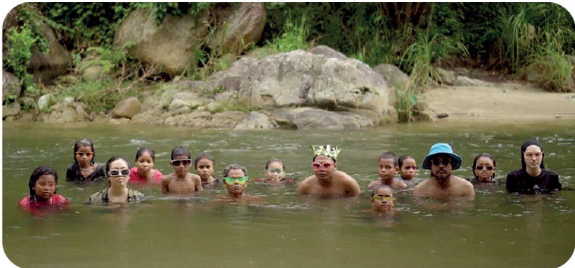
Projek Rabak. Hik Bersamak - Indigenous Pop . Video Still 2022.

Collateral Event of the 59th International Art Exhibition – La Biennale di Venezia 23 April -27 November 2022, Archivi della Misericordia, Venice, Italy